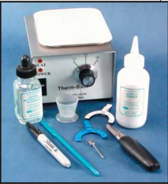
Tools and supplies necessary for taking a proper construction bite

Note: The vertical and AP position as provided by the Per-Fect Bite can always be modified by grinding a custom notch on the Per-Fect Bite.